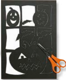
Cut it out.