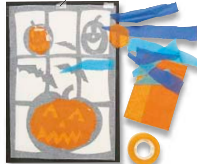
Tape on tissue paper.