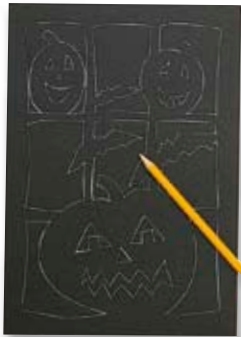
Draw a picture.

Tape the tissue paper to the back of your picture.