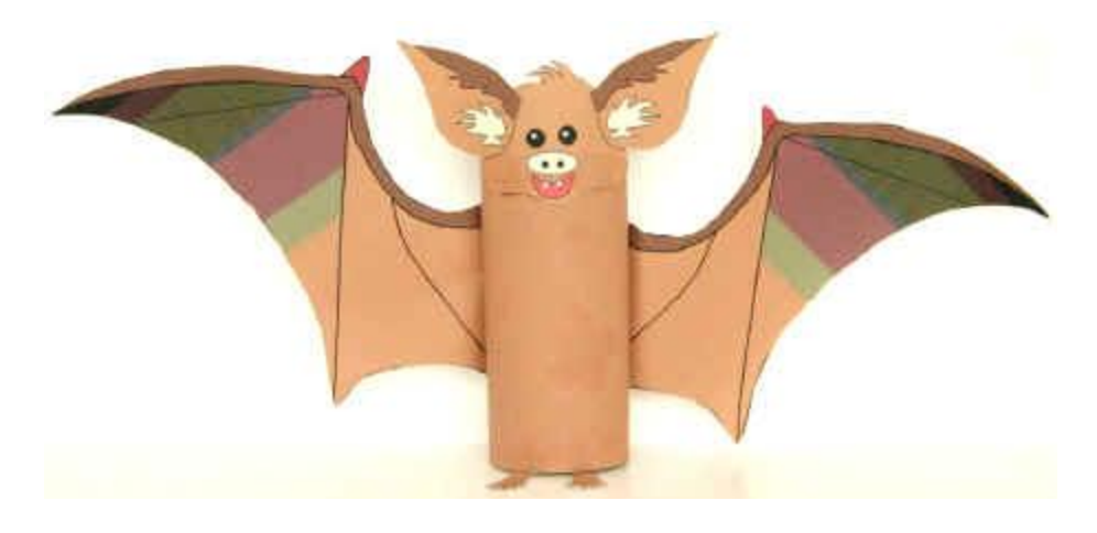
Bat Toilet Paper Roll